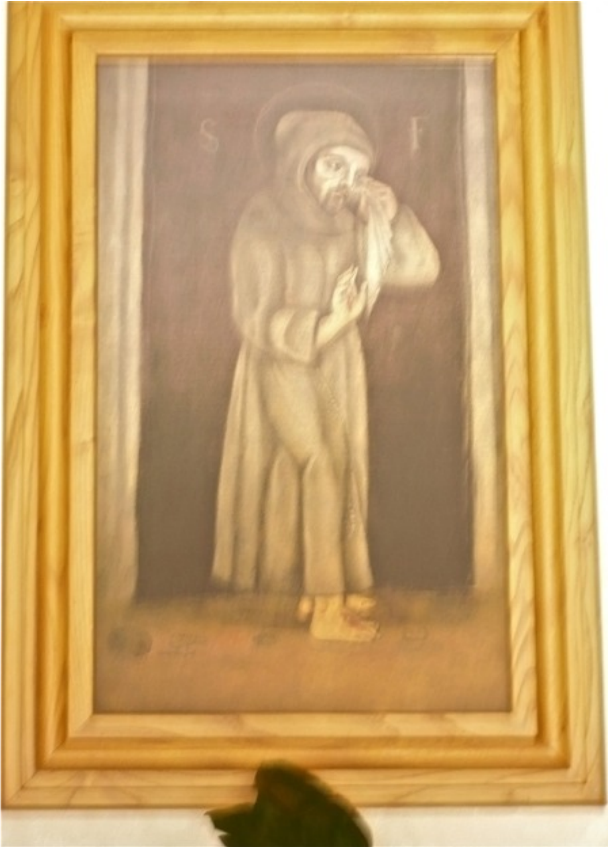
The doors a bronze showing the death of Clare holding her rule.