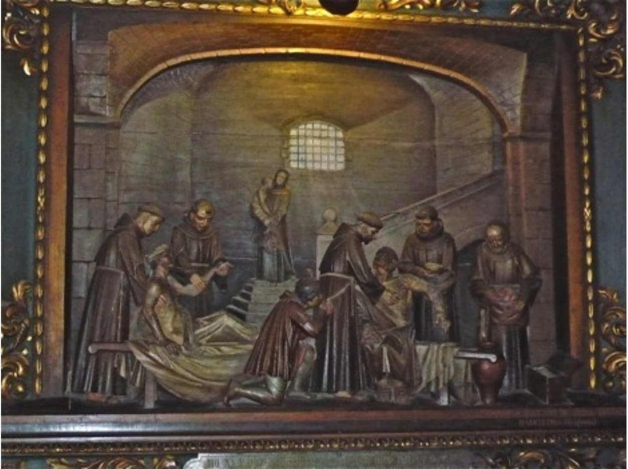
This creche at the back of the new church moves and has music around the nativity scene.