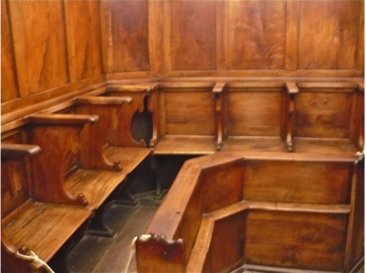
The chapel of ST. Bonaventure. The villagers stood behind this screen to hear mass.